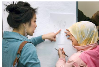
Writing Partners' Students in a First Year Experience course