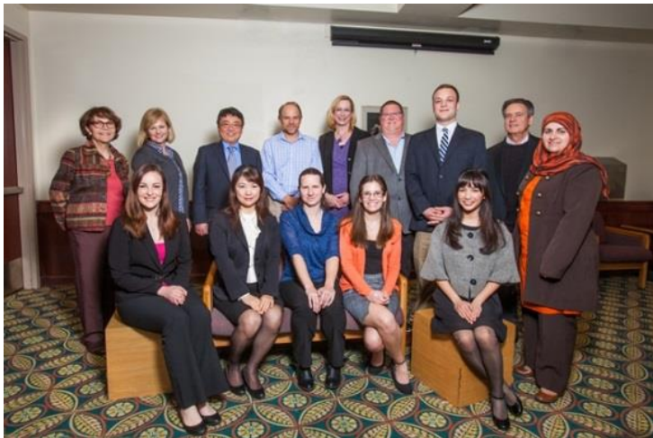
Scholarship Recipients and Faculty