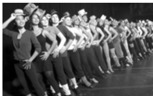
CAST OF "A CHORUS LINE"

In an homage to the show's original staging, Brazo has chosen to present the over-the-