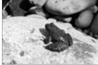
MOUNTAIN YELLOW-LEGGED FROG