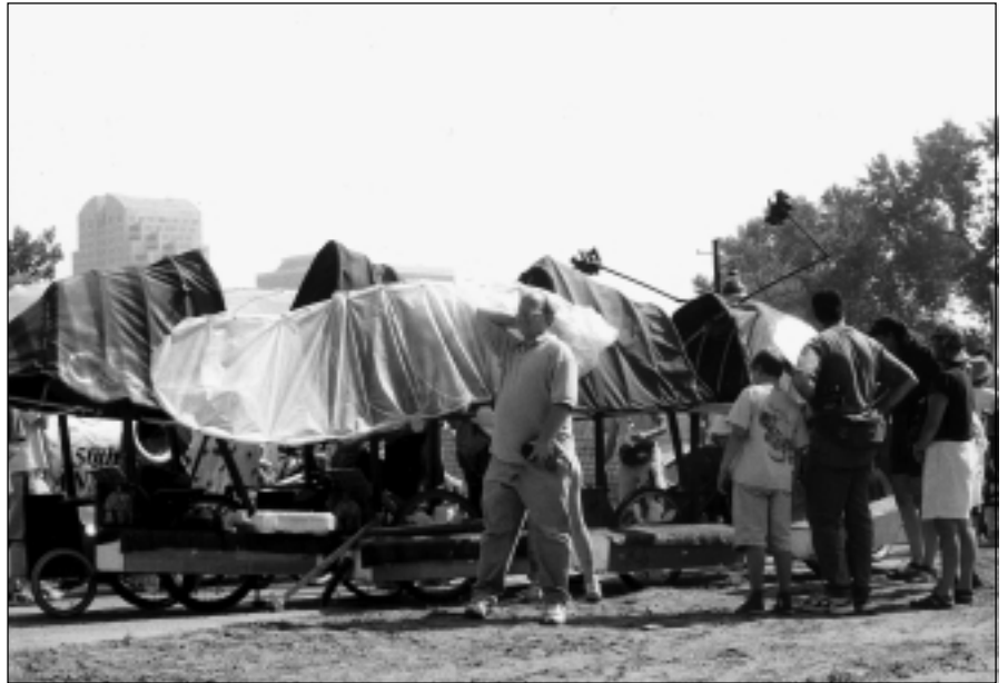
KINETIC HERKY – Eight CSUS engineering students recently entered this 30-foot Herky in the region's first River Otter Amphibious Race. The event featured human-propelled vehicles known as "kinetic sculptures." Contestants raced by land from Old Sacramento, through both the American and Sacramento rivers, and finished at West Sacramento's new River Walk Promenade.