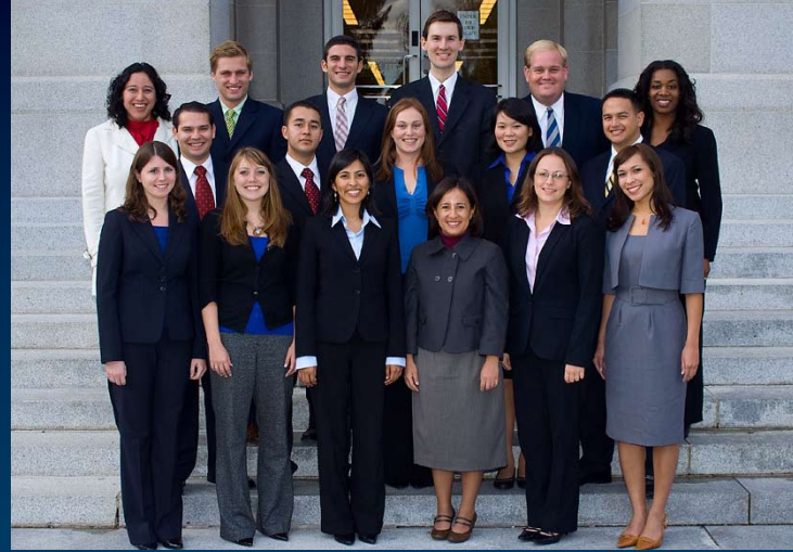
2008-2009 Executive Fellows