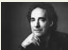
Alum Harry Shearer, page 7