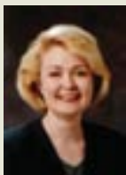
Alum Loretta Lynch, page 7