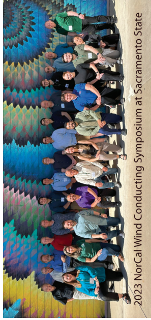
2023 NorCal Wind Conducting Symposium at Sacramento State

Mornings are devoted to podium time for Participant/Conductors with a 45-piece band. Each conductor will conduct the band daily for 10 minutes and have their session video recorded. During conducting, one clinician provides audio comments on the recording while another works with the conductor in front of the ensemble. Each conductor will be in front of the band five times during the Symposium.