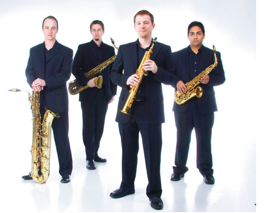
Iridium Saxophone Quartet