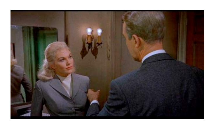
1 Point 1 Shot Low angle shot: You can shoot one or two subjects from a low angle. You do not have to replicate this shot--compose your shot any way you like. 1 shot