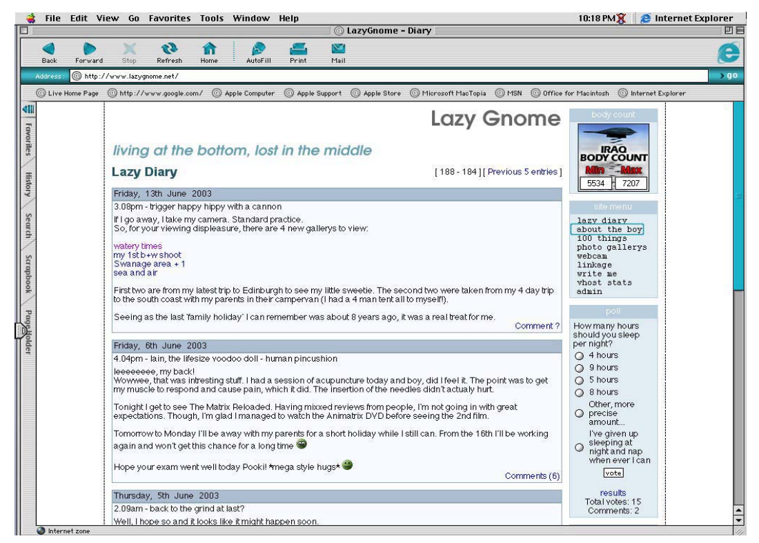
Figure 2. A sample blog

selected for analysis were established, English-language, text-based blogs. An estimated 60% of the randomly selected blogs met these combined criteria. As we were primarily interested in active blogs, we also excluded any blogs that had not been updated within the two weeks prior to data collection; this resulted in the elimination of several additional blogs.