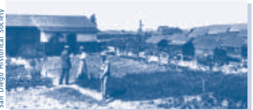
Little Landers half-acre farm with house, garden, and chicken pens (c.1912)