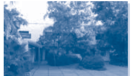
The Beer Garden at the Tecate Brewery