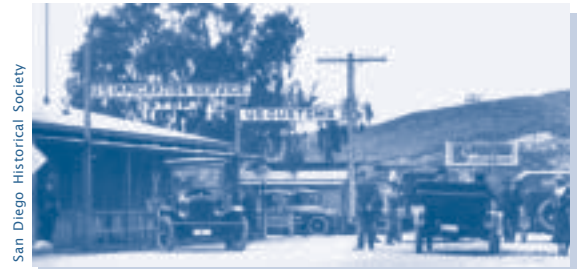
San Diego Historical Society

The channelization of the Tijuana River in Mexico in the early 1980s also opened a large area of Tijuana near the international border to development. The project located modern shopping centers, hotels, government offices, private sector office buildings, the Cultural Center, and residential areas in Tijuana on the former flood plain, displacing irregular settlements, auto dismantlers, and mixed commercial activities. Although the channel was originally planned to extend into the United States and to the ocean, environmentalists forced U.S. authorities to rescind the plans and to create the Tijuana River National Estuarine Research Reserve at the mouth of the river. This prevented plans for development in the lower river valley and also derailed efforts to extend a freeway across the valley to Playas de Tijuana for a proposed border crossing to link with the new toll road to Ensenada. The creation of the estuary reserve assured that future border developments in San Diego would concentrate on Otay Mesa-Mesa de Otay, farther to the east. ■