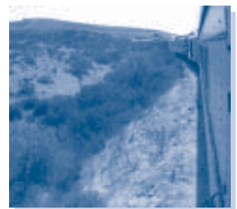
The train to Tecate climbs eastward through rugged scenery

The CCPH Conference program will feature intriguing sessions and panel discussions that illustrate how the borders of California's history are being expanded through scholarship, media, and interpretation. A few of