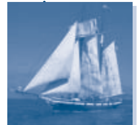
The Californian may soon be our official state tallship

Revenue Cutter Lawrence , which operated along the California coastline from 1849 until it wrecked off Point Lobos near Monterey in 1851. The Californian was built in 1984 and was recently acquired by the San Diego Maritime Museum, which will operate it as an "educational vessel and historic asset to promote and encourage an appreciation of the maritime heritage and coastal resources of the State of California." The bill was passed unanimously out of the Assembly on April 24, was passed unanimously by the Senate on July 10, and enrolled and sent to the Governor on July 14. On June 7 the CCPH board voted to support this bill. ■