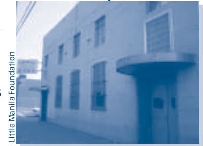
Little Manila Foundation