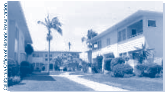
California Office of Historic Preservation

The full testimony from the hearing visit resourcescommittee.house.gov/108cong/parks/2003jun03/agenda.htm . ■