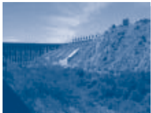
The train ride to Tecate offers a rare view of Rodriguez Dam, Tijuana's water source

vintage trains of the Carrizo Gorge Railway to ride the Iron Road of the Californias, the F.C. Tijuana y Tecate section of the historic San Diego and Arizona Railroad. One of the few bi-national railroads in North America, the SD&A was also known as the "Impossible Railroad" for its unique engineering and construction history.