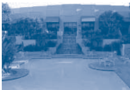
The Marriot Mission Valley Hotel's lovely pool and waterfall

Suggested topics for sessions and papers include the California/Mexico border, archives of the Californias, tourism and history, transportation, urbanization and the environment, new trends in Public History, the military and aerospace industries, San Diego, and Baja California.