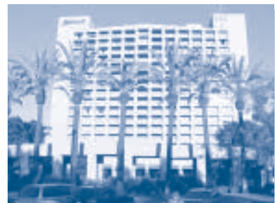
The conference will be held at the Marriott Mission Valley Hotel in San Diego

All members and interested individuals are invited to join us for what is sure to be yet another enlightening and entertaining meeting. But why not consider doing more than attending this year? How about being a part of the conference, too? Each year conference attendees come away with new information and ideas about the work of doing public history and about what it means to be a public historian in California. And the reason they do is a direct result of the contributions of the people who each year present papers and participate in panels. Our conferences would be nothing if not for these contributions. For this we thank our members, and invite all of you to consider submitting a paper or session proposal. You'll be giving back to your profession by keeping your colleagues informed (and you'll be greatly improving your chances of having your employer pick up the tab for attending).