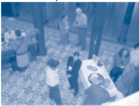
The mosaic floor of Eureka's Carnegie Library is shown off in fine style during the conference's opening reception.

CCPH congratulates all our awardees and thanks them for their service to the work of public history and public historians. For more information about the CCPH awards, and a listing of past award winners, visit our web site at www.csus.edu/org/ccph . ■