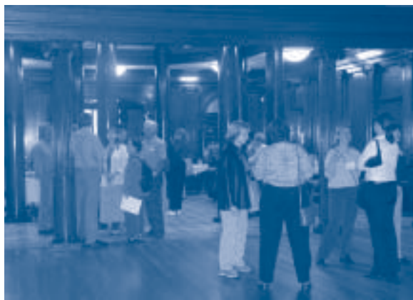
Conference attendees enjoy the opening reception amid the gorgeous wood detailing at Eureka's former Carnegie Library