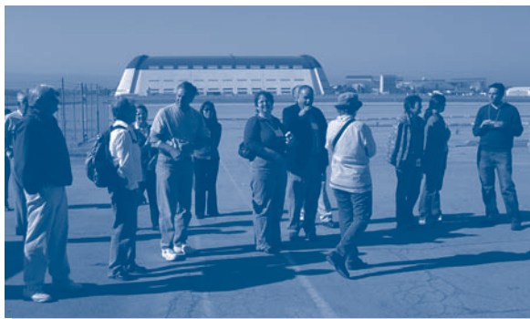
A little false perspective on Hangar 1, as seen from the south side of Hangar 2 (and from very, very far away)