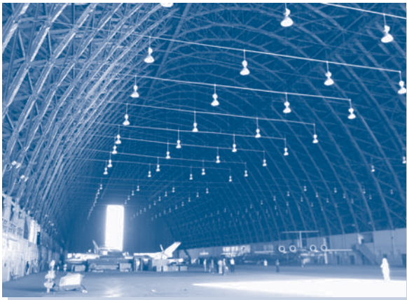
The skeletal interior of Hangar 2