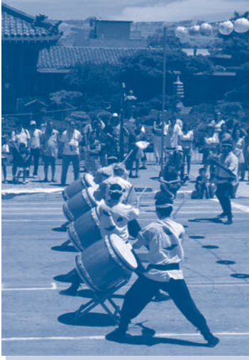
The San Jose Buddhist Church's Obon Festival draws large crowds to the city's Japantown—the community is a focus of one of the CCPH conference tours.

San Jose is proud of the cultural and ethnic diversity of its population, and the rich cultural identity of its many neighborhoods. The population in San Jose is 27 percent Asian and 30 percent Hispanic. Japantown and the Japanese Friendship Garden are popular tourist stops. Biblioteca Latinoamericana holds one of the largest collections of Spanish language materials in Northern California. The Martin Luther King, Jr. Library is the largest public library west of the Mississippi and displays artwork on every floor. Home to the largest Vietnamese community outside of Vietnam, San Jose is constructing the nation's first Vietnamese Heritage Garden and Historical Museum. Year-round, San Jose sponsors many cultural festivals and numerous ethnic chambers of