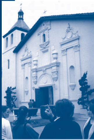
The chapel at Santa Clara University