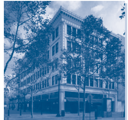
The Twohy Building in downtown San Jose is a marvelous example adaptive reuse

Three optional tours planned during the conference will take conference goers to Moffett Field's wooden blimp hangars, Santa Clara University's archaeological site,