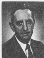
Robert A. Good