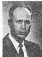
George W. Creel