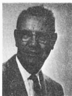
F. Blair Mayne