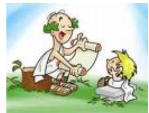
We all need a mentor

Those members interested in either obtaining or serving as a mentor should contact the current Vice President of Education.