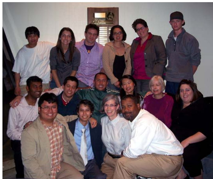
TLC Members gather near the TLC Founders Plaque in the CSUS University Union

A reporter and photographer from the Sac State Hornet were on hand to capture the scene as 16 of TLCs more than 30 members posed in front of their Founders Plaque. The plaque contains all the names of TLC members who joined during 2007 and were among the first members of our organization.