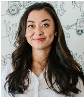
Chanel Miller - Guest Lecturer Sexual Assault Awareness Month

Other significant collaborations included CEC's co-sponsorship of: Women's Studies' lecture by Chanel Miller, and the Multi-Cultural Center's panel on Advancing Social Justice through the Pandemic. CEC also partnered with the Center for Teaching and Learning to offer a Faculty Learning Community, and the College of Social Sciences and Interdisciplinary Studies to offer ID 199 for students in our Community Engagement Student Fellows program and our Volunteer Student Leaders program.