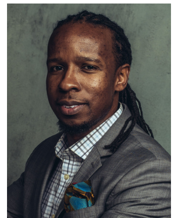
Ibram X. Kendi - Keynote Speaker Fall 2020 Convocation

CEC was represented on the Steering Committee for the Fall 2020 University Convocation, Advancing our Commitment to Antiracism , and on the University Anchor Advisory Committee. CEC is proud to partner with SMUD to continue hosting the monthly meetings of Network Café.