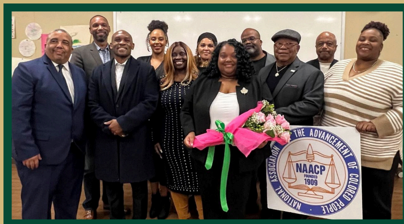
Greater Sacramento NAACP