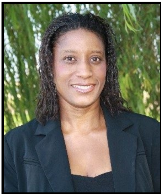
Ramona Mosley Award for Peace Service