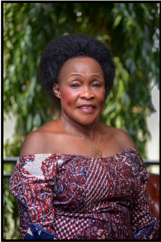
Betty Bigombe Peacemaker Award

Until recently Betty Bigombe, has been Senior Director, Fragility, Conflict and Violence at the World Bank. Bigombe has played a key role in conflict resolution in Africa. She led the peace and humanitarian efforts in northern Uganda, first in the 1990s as Minister of State for Northern Uganda and again as chief mediator to the conflict in the mid-2000s.