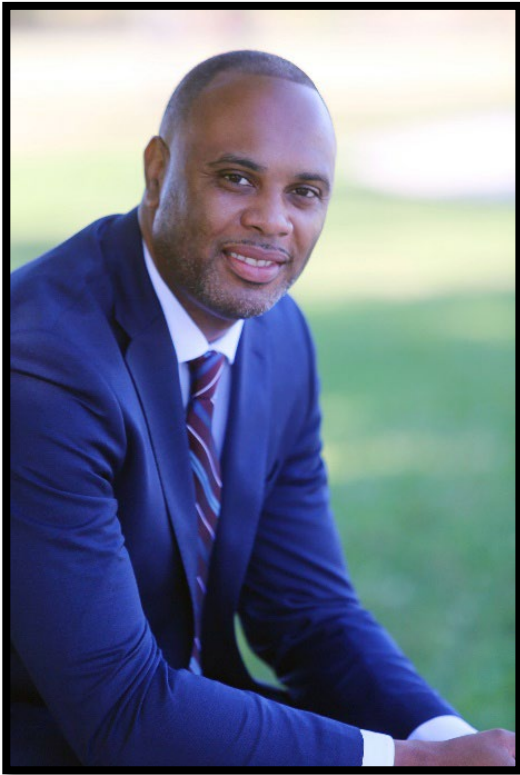
Pastor Les Simmons Award for Peace and Justice