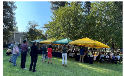
Photos from the SSIS Fall Welcome and Convocation