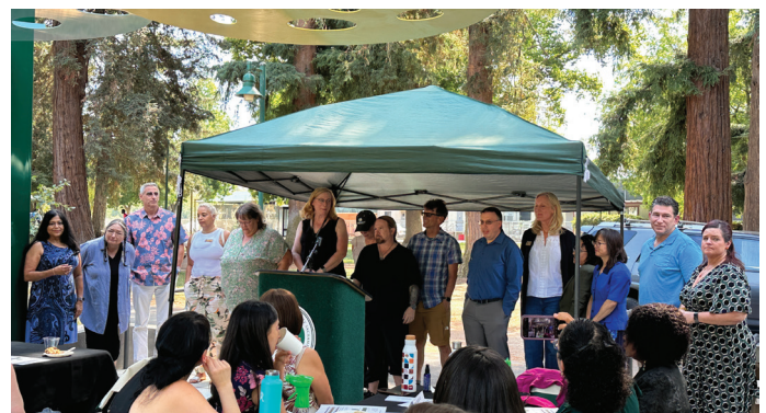
Photos from the Fall 2023 SSIS Convocation