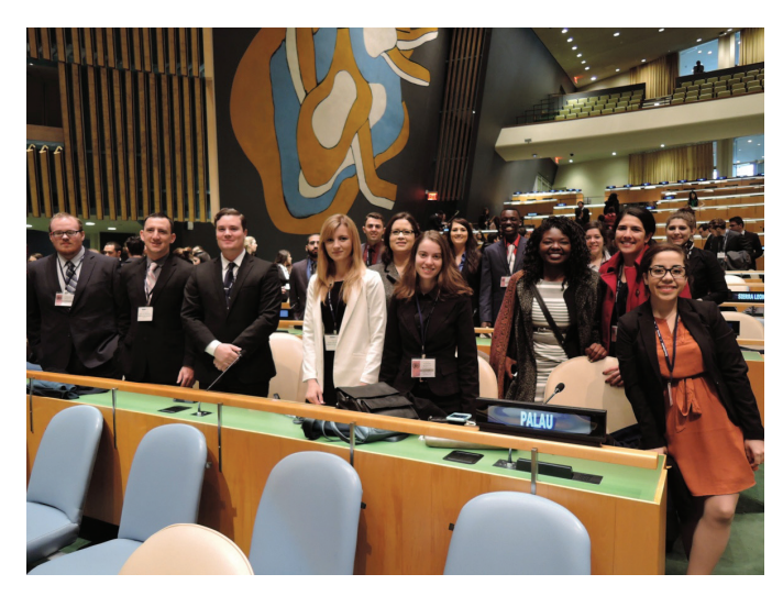
The delegation is inside the UN General Assembly Hall waiting for the closing ceremonies

This past March during spring break the Sacramento State government department's Model United Nations delegation traveled to New York and participated in the 2015 National Model United Nations (NMUN) conference representing the non-governmental organization the Association for Women's Rights in Development (AWID) in nine different committees. The NMUN conference is academically challenging and truly international, attracting some 5,000 students, 60% from foreign universities. The students prepared throughout the fall and early spring semesters, researching the real-world problems they would be addressing in committee as well as crafting solutions to those problems applying an AWID's perspective. Their hard work was recognized in New York with seven total awards.