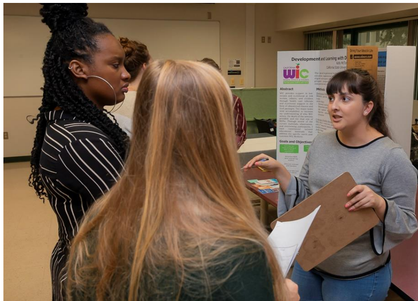
Students in "Community Nutrition" (NUFD 117) course showcasing their field placement experience in the poster session.

Effective January 1, 2024, the Commission on Dietetic Registration (CDR) will require a minimum of a master's degree to be eligible to take the credentialing exam to become a registered dietitian nutritionist (RDN). In order to be approved for registration examination eligibility with a bachelor's degree, an individual must meet all eligibility requirements and be submitted into CDR's Registration Eligibility Processing System (REPS) before 12:00 midnight Central Time, December 31, 2023 . For more information about this requirement visit CDR's website: https://www.cdrnet.org/graduatedegree . In addition, CDR requires that individuals complete coursework and supervised practice in program(s) accredited by the Accreditation Council for Education in Nutrition and Dietetics (ACEND). Graduates who successfully complete the ACEND-accredited DPD program at California State University, Sacramento are eligible to apply to an ACEND-accredited supervised practice program.