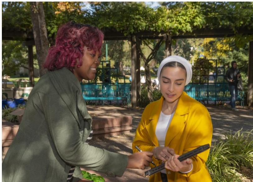
Nutrition and Food students volunteering at Associated Students, Inc. Food Pantry

For colleges within California we use ASSIST to determine course equivalency. For colleges or Universities not listed in ASSIST you will be asked to provide the transcript, course description and syllabus of the course for further evaluation.