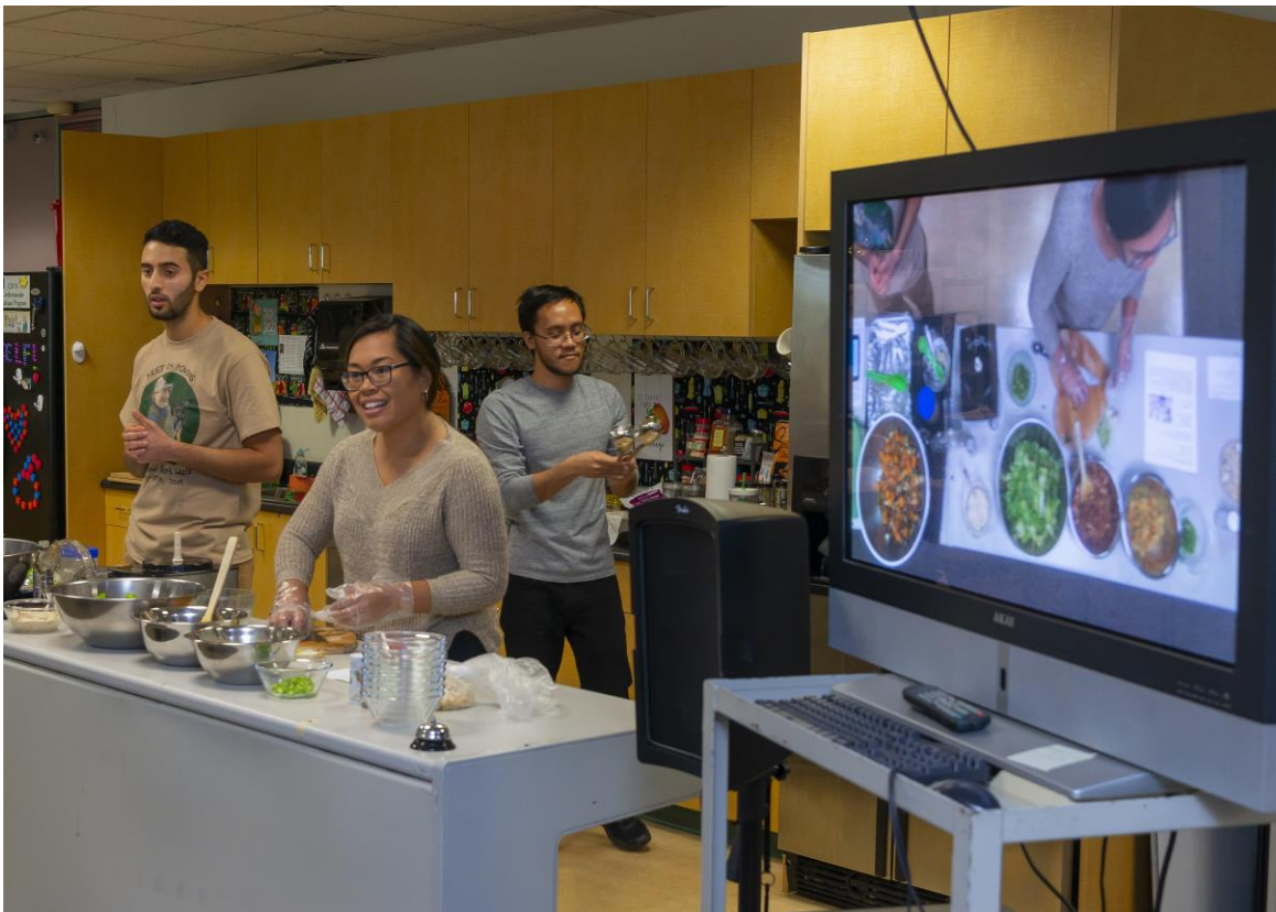
Volunteers demonstrating cooking lessons at the university's Cardiovascular Wellness Program

Compliance with the CDR Professional Development Portfolio (PDP): Requirements to maintain NDTR registration include 50 hours of continuing education every five years.