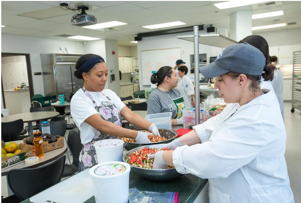
“Food Production and Sustainability” (NUFD 110) students assisting with “Bites on the Bridge” food preparation