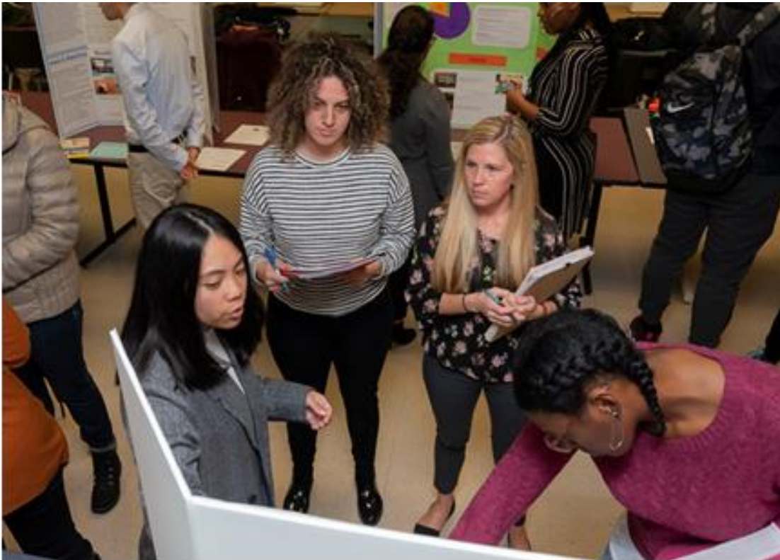
Students in “Community Nutrition” (NUFD 107) course showcasing their field placement experience in the poster session.

The Academy has provided resources and information for international students you might find helpful in order to become an RD and pursue a career in dietetics, including answers to frequently asked questions.