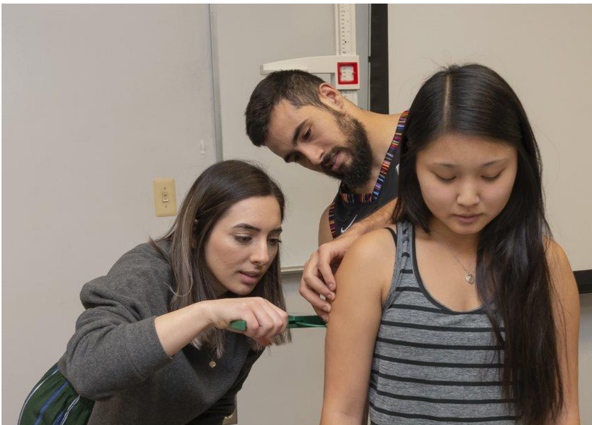
Students practicing taking anthropometric measurements in the “ Nutrition Assessment ” (NUFD 121) course

*Program outcome data is available upon request