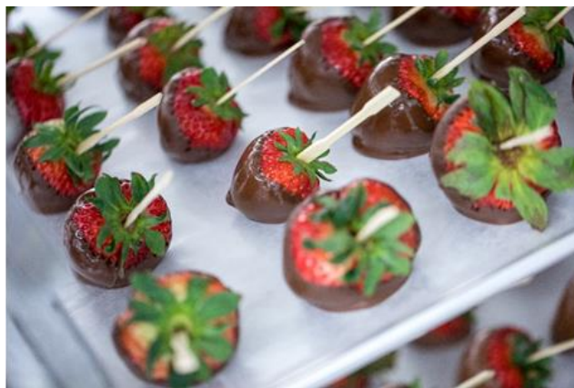
Treats prepared by “ Food Production and Sustainability ” (NUFD 110) students for “Bites on the Bridge” event.

According to the Bureau of Labor Statistics, employment of dietitians and nutritionists is projected to grow 11% from 2018 to 2028 , much faster than the average for all occupations. In recent years, interest in the role of food and nutrition in promoting health and wellness has increased, particularly as a part of preventative healthcare in medical settings.