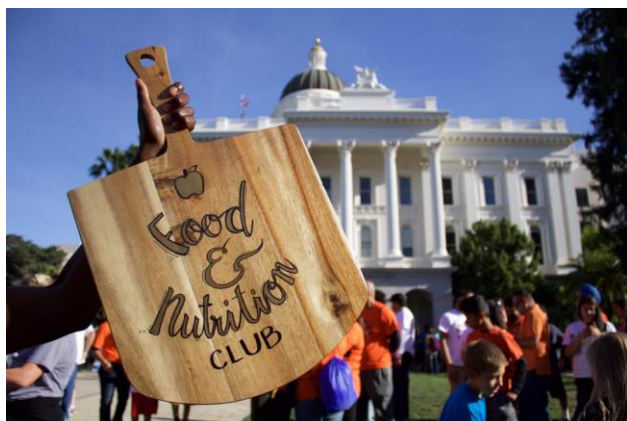
Food and Nutrition (FAN) Club at Sacramento State

Within the university, our department's Food and Nutrition (FAN) Club helps students get involved in and off campus in nutrition-related events and activities.