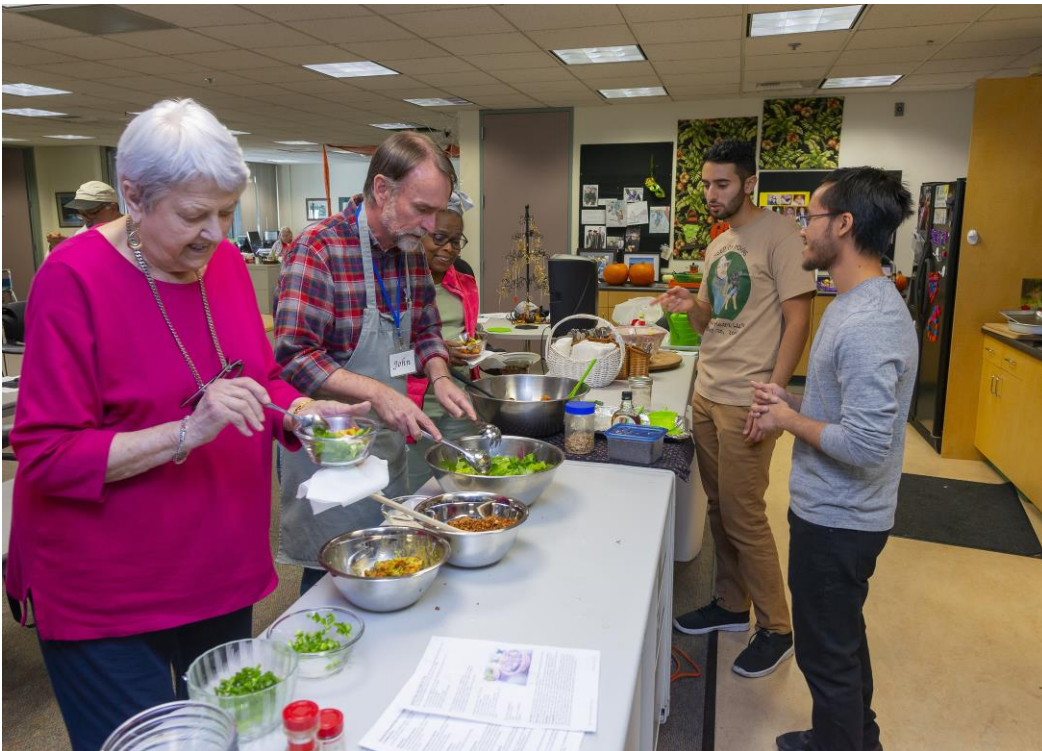
Nutrition and Food students demonstrating cooking lessons at the university's Cardiovascular Wellness Program