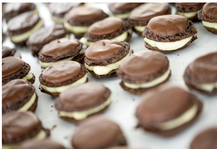
Treats prepared by “Food Production and Sustainability” (NUFD 110) students for “Bites on the Bridge” event.

The DPD Director's signature on this form verifies that the individual has successfully completed the program requirements. Once the student's degree is posted, the director will issue a Verification Statement and a minimum of six copies will be mailed directly to the student. Alternatively, the student will be emailed Verification Statement signed with the DPD Director's digital signature that can be authenticated.