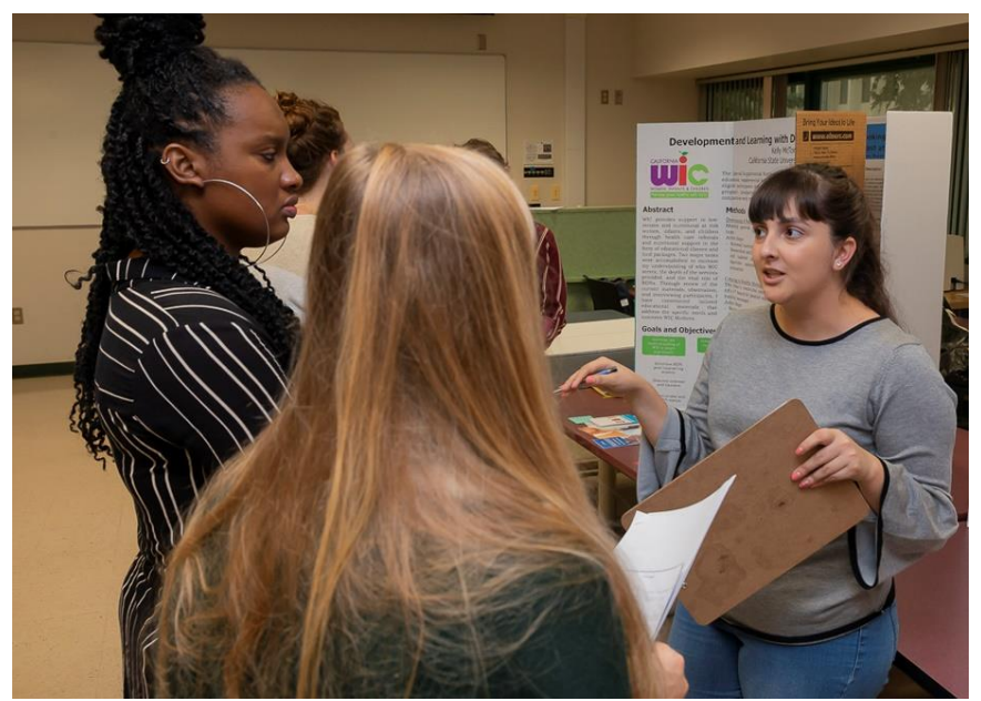
Students in "Community Nutrition" (NUFD 117) course showcasing their field placement experience in the poster session.

Effective January 1, 2024, the Commission on Dietetic Registration (CDR) will require a minimum of a master's degree to be eligible to take the credentialing exam to become a registered dietitian nutritionist (RDN). In order to be approved for registration examination eligibility with a bachelor's degree, an individual must meet all eligibility requirements and be submitted into CDR's Registration Eligibility Processing System (REPS) before 12:00 midnight Central Time, December 31, 2023 . For more information about this requirement visit CDR's website: <u>https://www.cdrnet.org/graduatedegree</u>. In addition, CDR requires that individuals complete coursework and supervised practice in program(s) accredited by the Accreditation Council for Education in Nutrition and Dietetics (ACEND). Graduates who successfully complete the ACEND-accredited DPD program at California State University, Sacramento are eligible to apply to an ACEND-accredited supervised practice program.