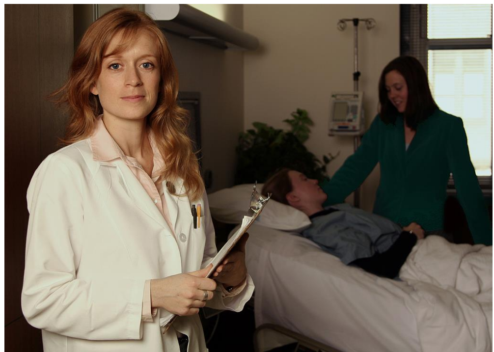
Academy of Nutrition and Dietetics Stock Photo Library

Drug Testing and criminal background checks or any other medical tests or procedures, if required by the facility a student may be placed for field placement or service learning can be conducted at CSUS (Health Center and Police Department) or is provided through the field placement program. Students have to pay for the testing.