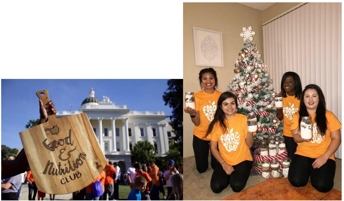
Food and Nutrition (FAN) Club at Sacramento State

Within the university, our department's <u>Food and Nutrition (FAN) Club</u> helps students get involved in and off campus in nutrition-related events and activities.