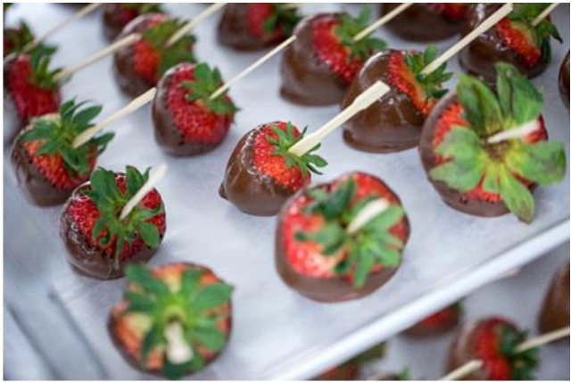
Treats prepared by "Food Production and Sustainability" (NUFD 110) students for "Bites on the Bridge" event.

According to the Bureau of Labor Statistics, employment of dietitians and nutritionists is projected to grow <u>11% from 2018 to 2028</u>, much faster than the average for all occupations. In recent years, interest in the role of food and nutrition in promoting health and wellness has increased, particularly as a part of preventative healthcare in medical settings.