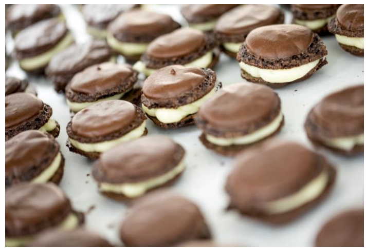
Treats prepared by "Food Production and Sustainability" (NUFD 110) students for "Bites on the Bridge" event.

The DPD Director's signature on this form verifies that the individual has successfully completed the program requirements. Once the student's degree is posted, the director will issue a Verification Statement and a minimum of six copies will be mailed directly to the student. Alternatively, the student will be emailed Verification Statement signed with the DPD Director's digital signature that can be authenticated.