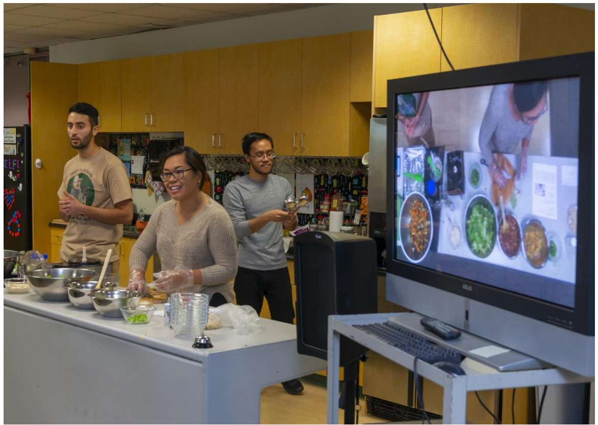
Volunteers demonstrating cooking lessons at the university's Cardiovascular Wellness Program

Compliance with the CDR Professional Development Portfolio (PDP): Requirements to maintain NDTR registration include 50 hours of continuing education every five years.