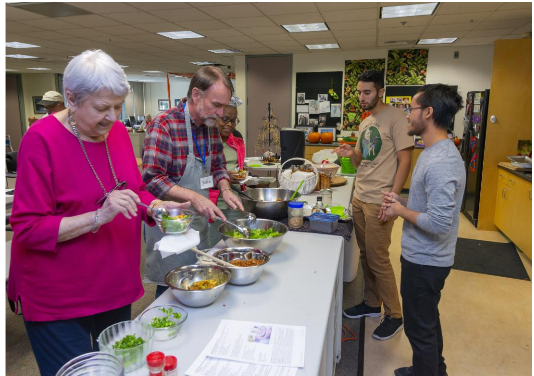
Nutrition and Food students demonstrating cooking lessons at the university's Cardiovascular Wellness Program