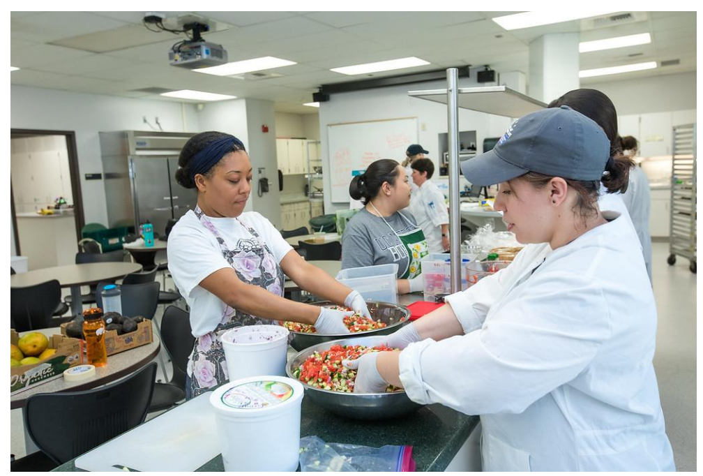
"Food Production and Sustainability" (NUFD 110) students assisting with "Bites on the Bridge" food preparation

6. Knowing and following the rules instituted to preserve academic honesty. This includes learning and following the particular rules and expectations for specific classes, exams, and course assignments. Ignorance of these rules is not a defense to academic dishonesty.