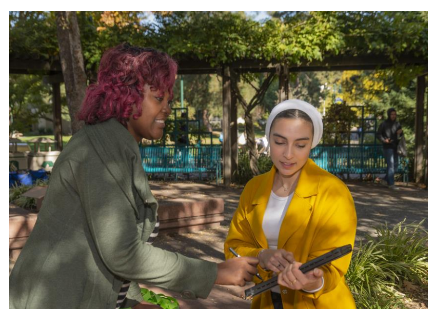
Nutrition and Food students volunteering at Associated Students, Inc. Food Pantry

For colleges within California we use <u>ASSIST</u> to determine course equivalency. For colleges or Universities not listed in ASSIST you will be asked to provide the transcript, course description and syllabus of the course for further evaluation.