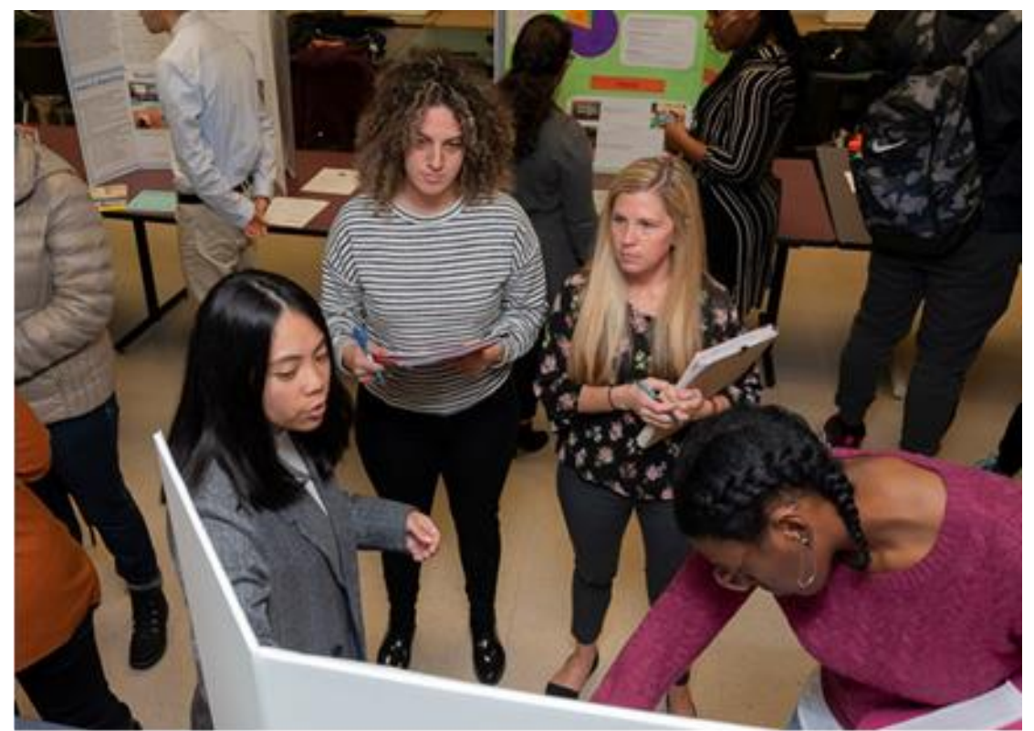
Students in "Community Nutrition" (NUFD 107) course showcasing their field placement experience in the poster session.

The Academy has provided <u>resources and information</u> for international students you might find helpful in order to become an RD and pursue a career in dietetics, including answers to frequently asked questions.