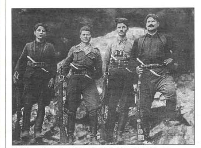
Resistance fighters in Greece during World War II pose for a photograph that appears in "The 11th Day: Crete 1941."