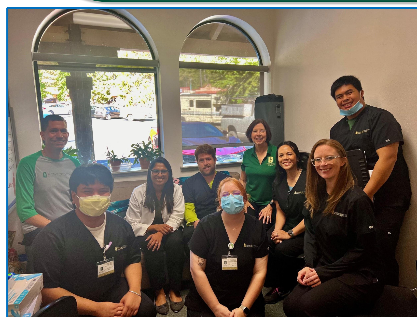
Health Hive event at Marshall Medical Center, Georgetown: Faculty and students providing hearing screening