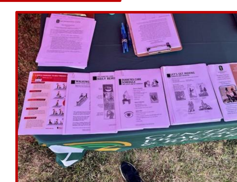
Faculty and students providing resources, blood pressure and blood sugar screenings