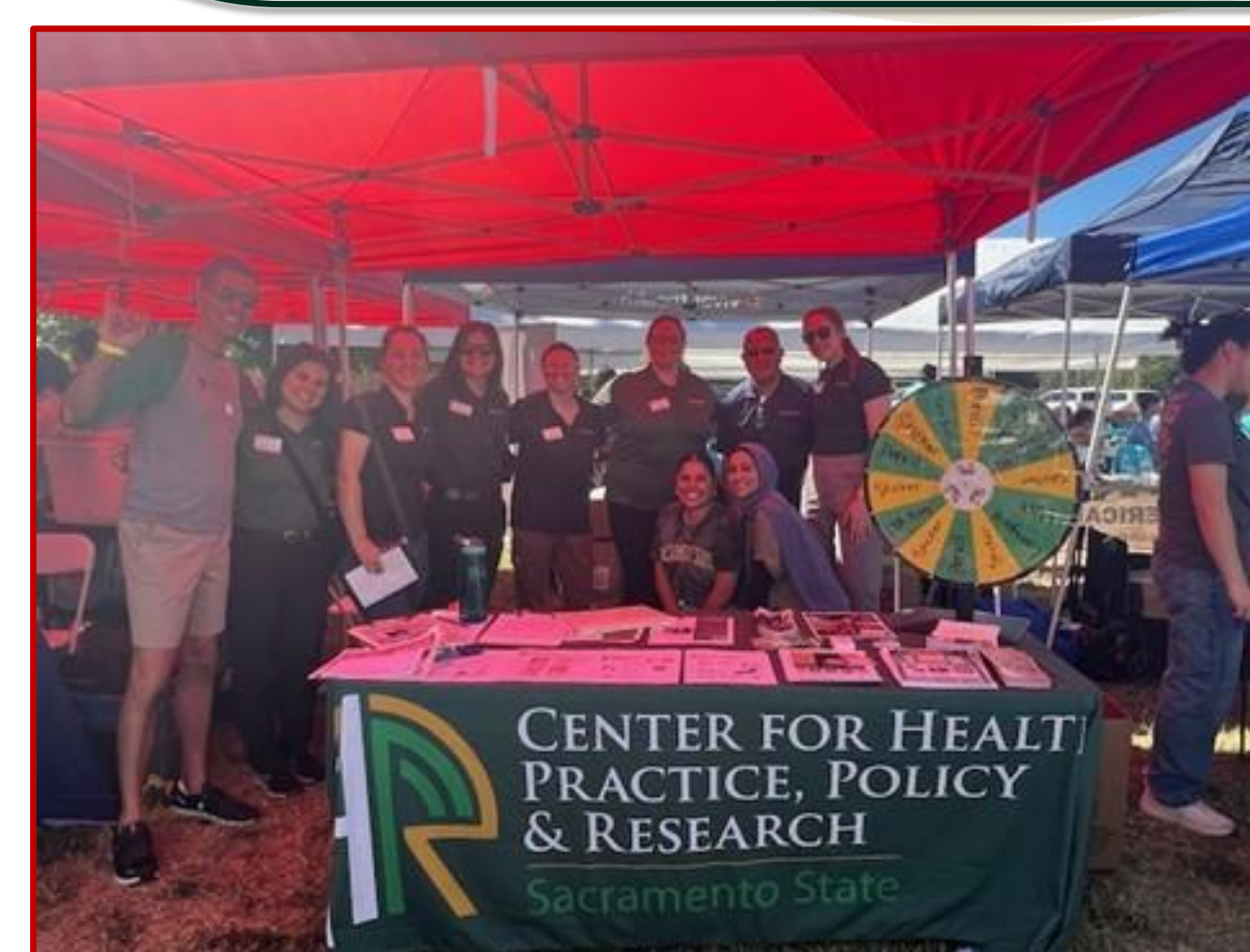
Health Hive event at Asian Community Center: Ohana Walk