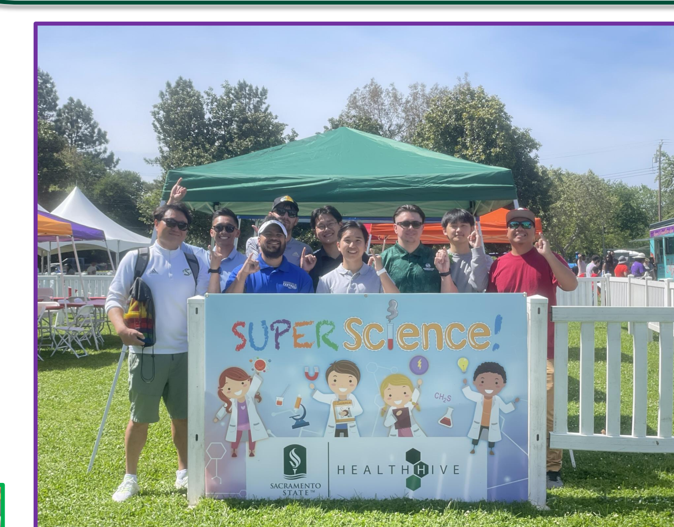
Health Hive event at Rancho Cordova's Kids Day in the Park: Faculty and students of RPTA, Physical Therapy and Audiology engaging children and family through a variety of activities