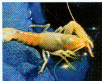
Cave crayfish