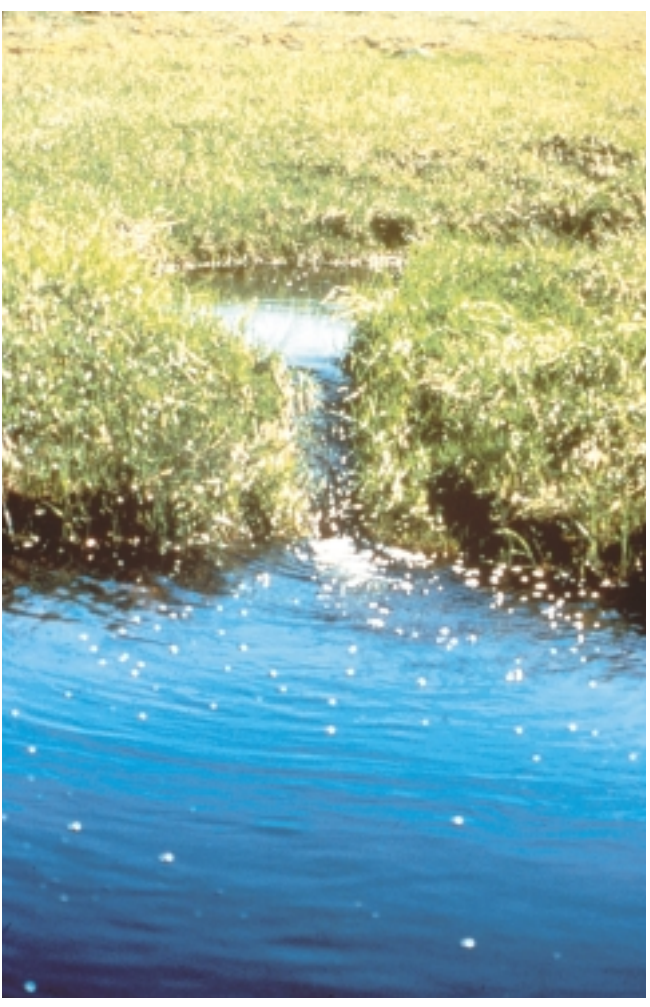
Sedimentation trap - a wetland function