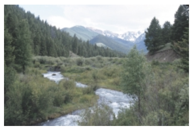
Wetlands help improve water quality

storing flood water and releasing it slowly, like a giant sponge.