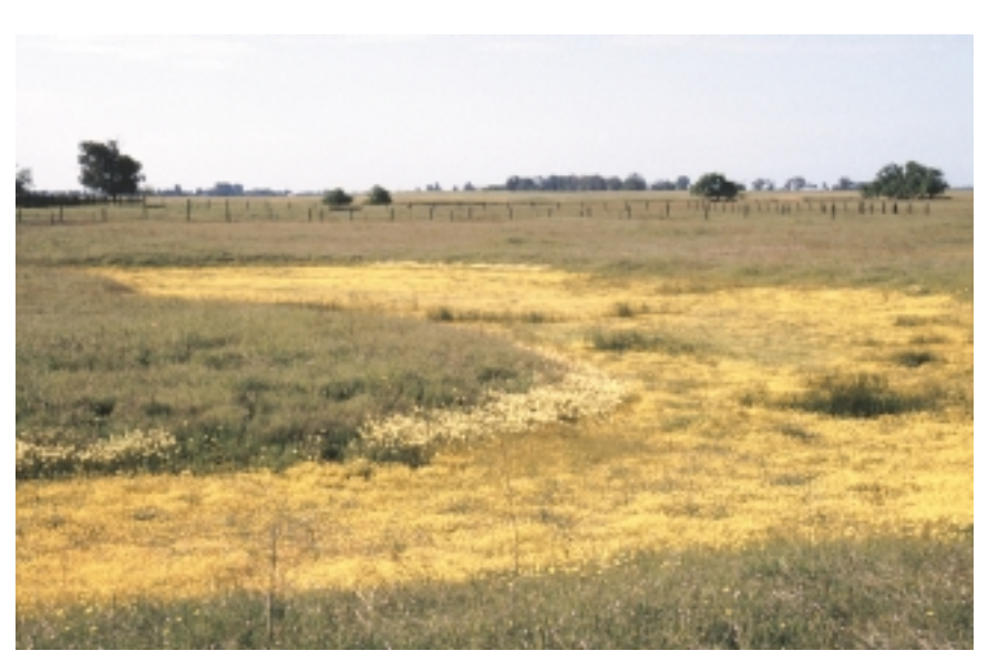
Vernal pool plant community

Wetland soils – called hydric soils – are identified in the field by digging a shallow hole (roughly 1 to 1½ feet deep) and examining the soil for evidence of long-term saturation during the growing season. Soils that are waterlogged