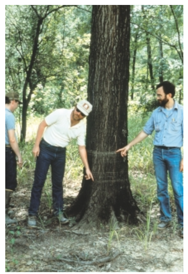
Watermark in seasonally-flooded wetland

Wetland delineators more often use hydrologic indicators that can be observed during a field inspection. For example, the following indicators provide evidence of periodic flooding or soil saturation: