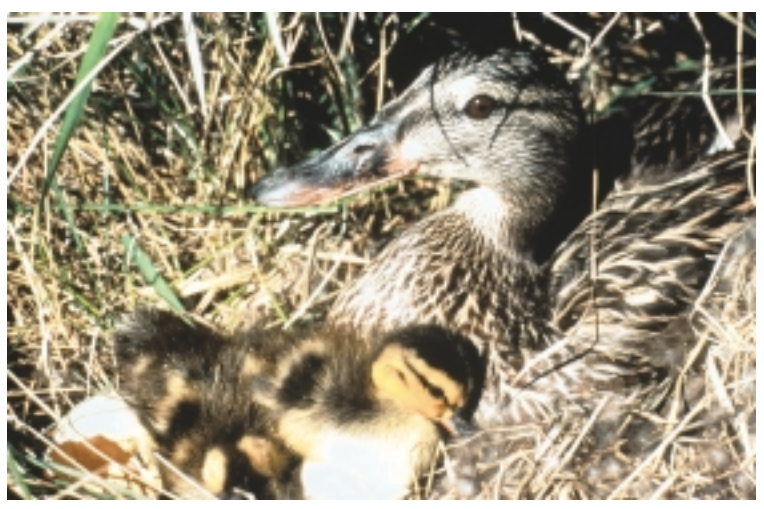
Wetlands provide habitat for wildlife