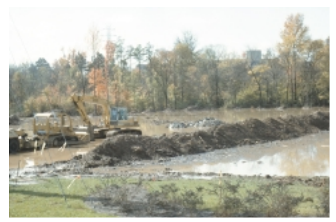
Wetland fill activity