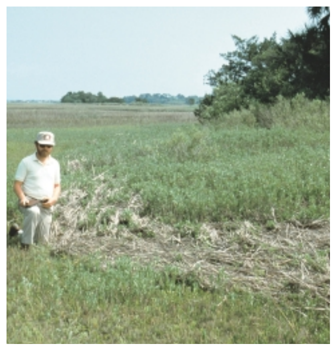
Drift line in tidal marsh