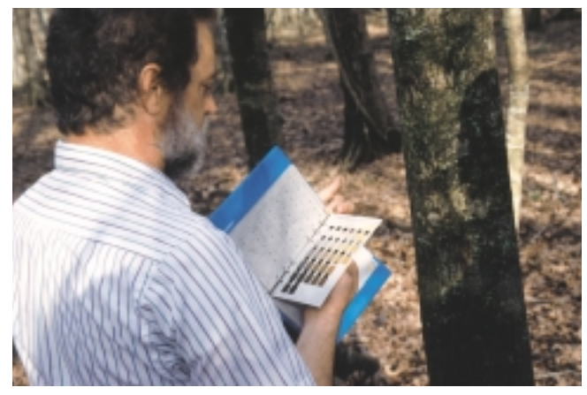
Wetland Delineator uses soil color chart to make a wetland determination

Contact the Corps District Office that has responsibility for the Section 404 permitting process in your area. This office will assist you in defining the boundary of any wetlands on your property, and will provide instructions for applying for a Section 404 permit, if necessary.