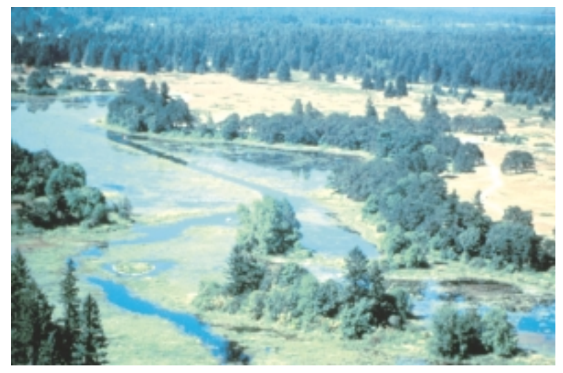
Watershed view of wetlands associated with a lake ecosystem