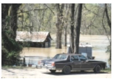
Wetlands help prevent flood damage

One of the goals of the Clean Water Act is to prevent the degradation of the Nation's waters, including needless destruction of wetlands. Wetlands benefit people in many ways that may not be obvious.