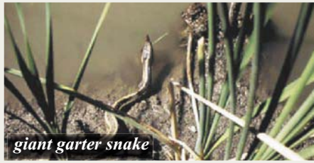
giant garter snake