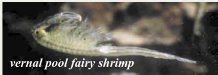
vernal pool fairy shrimp