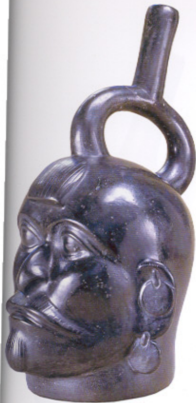
Fig. 2 Portrait of Bigote. Ceramic, c. A.D. 450. Private collection/Daltnau, Lima, Peru