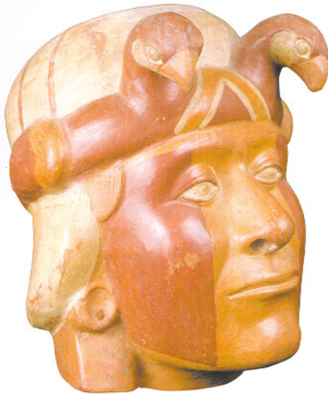
Fig. 1 Portrait of an individual wearing an elaborate bird headdress. Ceramic, c. A.D. 550. Museo Rafael Larco Herrera, Lima, Peru

To make a mold, a thick layer of clay was packed around the exterior of the mold matrix and divided with a vertical cut to make front and back halves. As the clay began to dry, the halves were carefully removed from the mold matrix, allowed to dry completely, and then fired. These two halves then became the mold in which portraits were made.