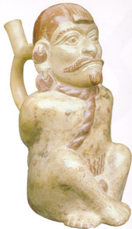
Fig. 4 Portrait of Bigote as a prisoner. Ceramic, c. A.D. 450. Museo Rafael Larco Herrera, Lima, Peru

European knights who dressed themselves and their horses at great expense in order to participate in jousting matches with splendid pageantry. In Moche society, the high-status adult males who participated in combat must have done so willingly, even though capture and sacrifice of some of the participants would have been the predictable outcome.