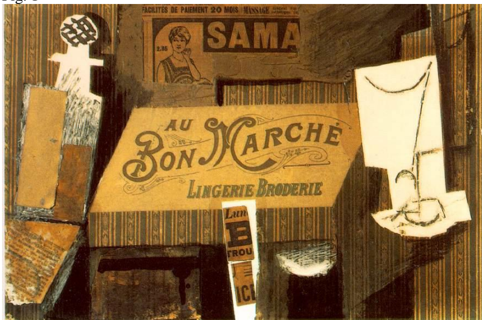
PABLO PICASSO, Au Bon Marché , 1913, Neue Galerie, Aachen