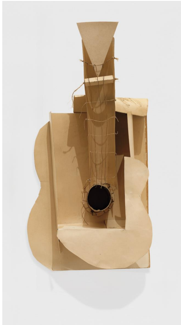
PABLO PICASSO, Maquette for Guitar , 1912, The Museum of Modern Art, New York