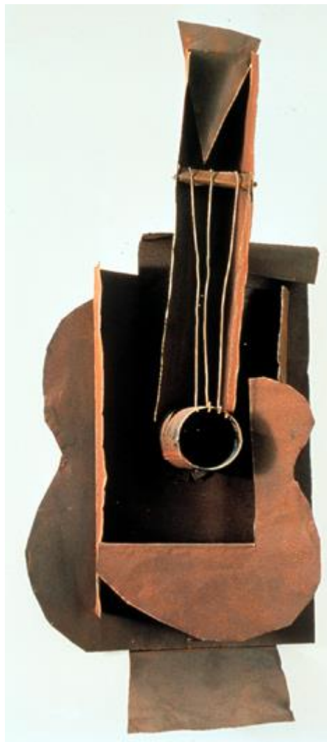
PABLO PICASSO, Guitar , 1914, The Museum of Modern Art, New York