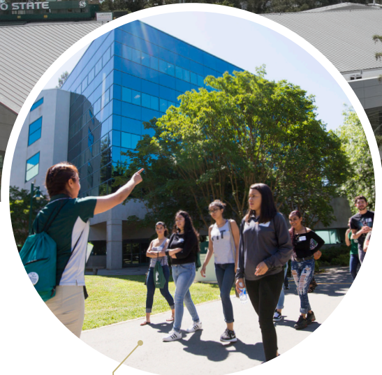
CALIFORNIA STATE UNIVERSITY, SACRAMENTO