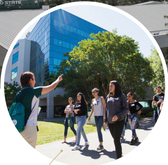
CALIFORNIA STATE UNIVERSITY, SACRAMENTO