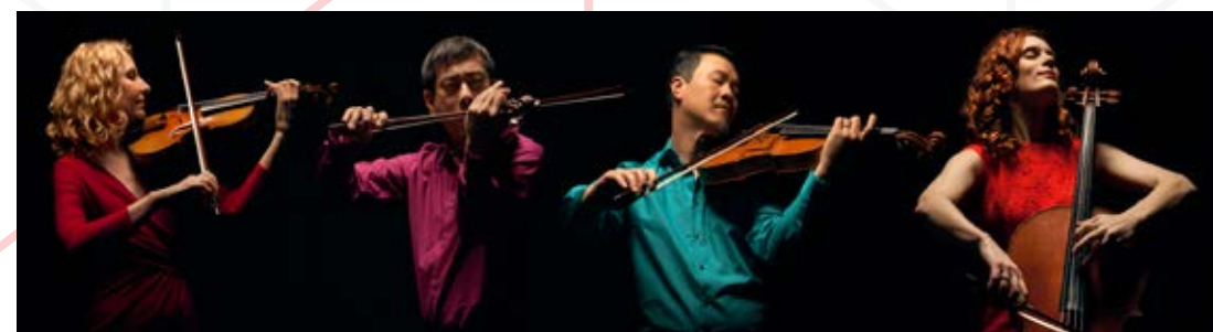
Del Sol String Quartet