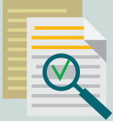
Career Counseling and Support Services