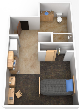
Studio | SINGLE OCCUPANCY