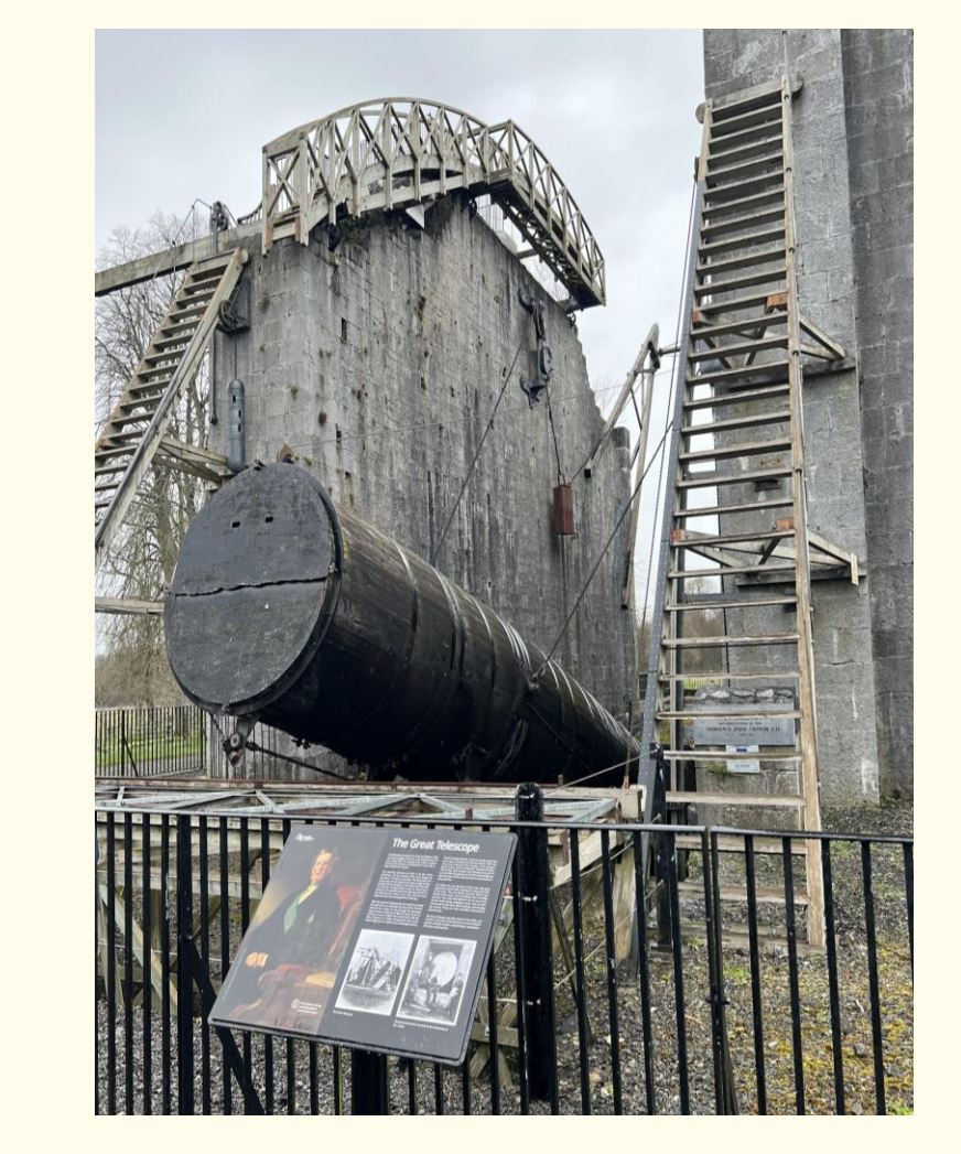
Birr Castle Home of the 3rd Earl of Rosse: an environmental and scientific time capsule